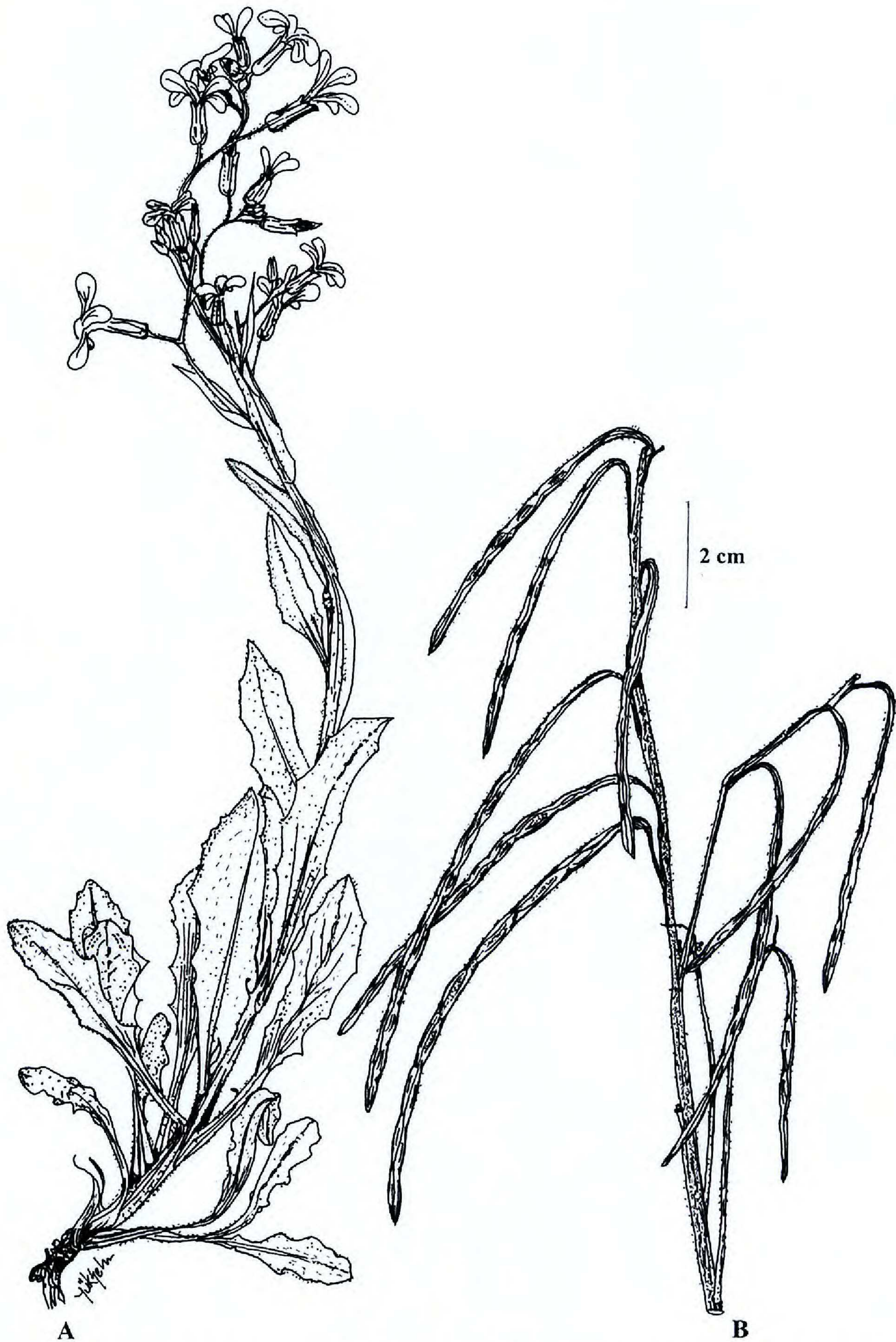
Figure 4. Hesperis hamzaoglui A. Duran. —A. Habit. —B. Fruits. Drawn from the holotype Duran 5694 & Hamzaoglu (KNYA).

grows naturally in Turkey and is a local endemic, with an allopatric distribution in relation to H. hamzaoglui . Diagnostic characters comparing H. hamzaoglui and H. podocarpa are provided in Table 2.